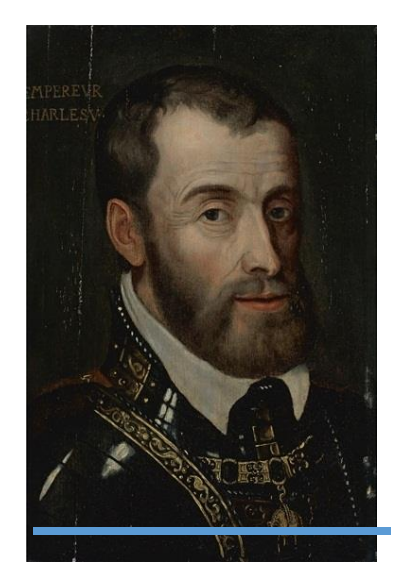
King Charles V

2. Explain why Cortés was so impressed when he arrived in Tenochtitlan.