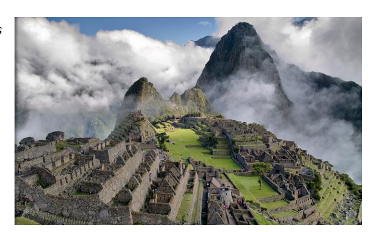
Machu Picchu, an Incan City designed to be a retreat for the Emperor Pachacuti

The civilizations of Mesoamerica were advanced in many ways. In fact, the accomplishments of the Maya, Aztec, and Inca Empires rivaled the advances of their European counterparts. Their achievements in math, science, government, and record-keeping left a mark on their world. Historians, archeologists, and