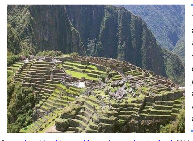
Document III: Terrace Farming in the Incan Empire

The Inca lived in the Andes Mountains, which stretch down the west coast of South America. Flat areas for people to farm were very hard to find. Instead the Inca dug terraces on mountain sides to grow crops. 2,471,053 acres of farmland covered much of the Incan Empire. (This figure includes both terraced and flat farms.) Interesting, the stones used to support terrace farming would gather heat throughout the day and during the night would distribute the heat to the plants. . . . [These stones also meant that] erosion was virtually impossible.