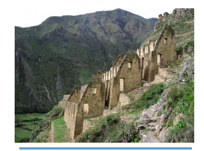
Incan Grain Storehouses

17. Why do you think that the Incans collected tribute? Explain.